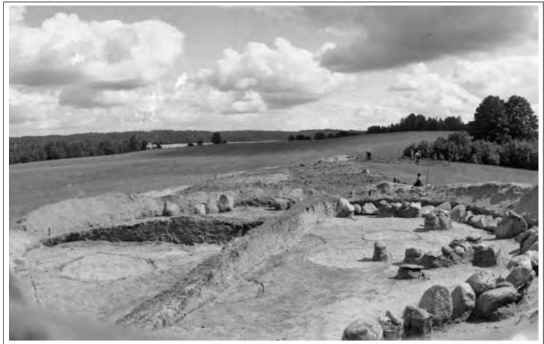
Fig. 1. The excavation of Taurapilis barrow 5 in 1970.

Nowadays, Taurapilis hill-fort has a 90-metre-long and 16-metre-wide trapezium-shaped plateau, and steep slopes 13 to 14 metres high. From inland it is surrounded by a ditch, which is 220 metres long, 25 metres wide and four metres deep. Beyond the ditch there is an open settlement. Based on stray finds (extensive excavations of the site have not been conducted yet), the hill-fort and the settlement have been dated back to