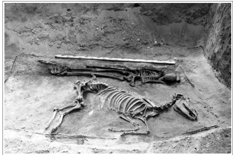
Fig. 2. The grave of Taurapilis barrow 5.

the first millennium AD and the first half of the second millennium (see Baubonis, Zabiela 2005, p.270).